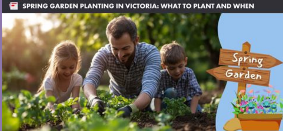
SPRING GARDEN PLANTING IN VICTORIA: WHAT TO PLANT AND WHEN